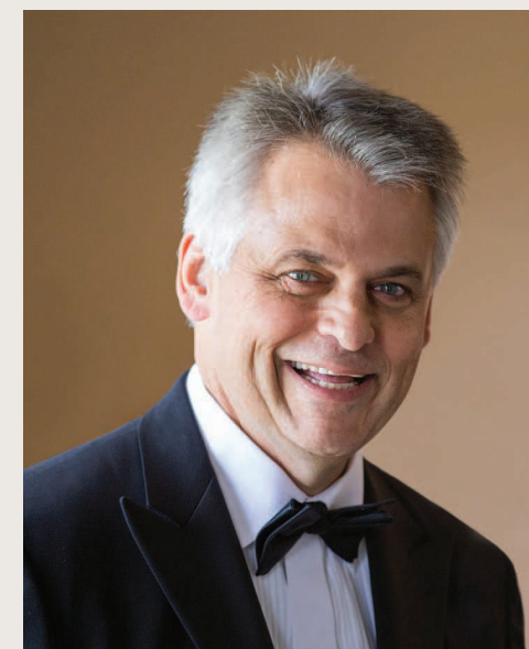
APRIL 12, 1962–APRIL 3, 2020