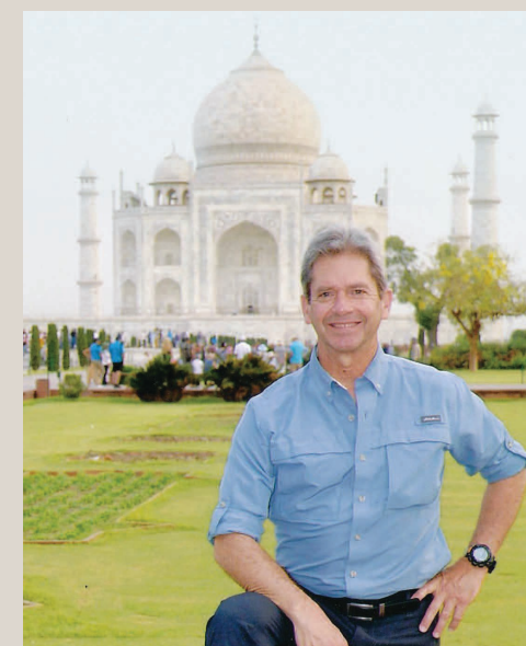
APRIL 9, 1952–MAY 14, 2020